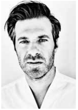
SERGIO HERMAN